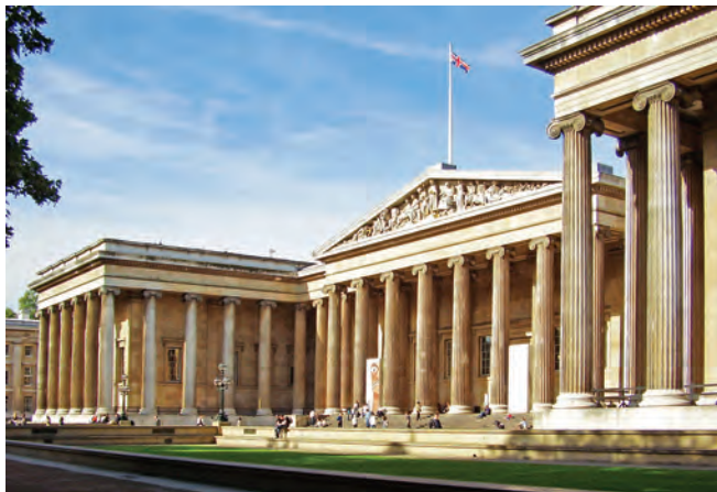
British Museum, England

British colonies. Presently the museum collection comprises about 80 lakh objects.