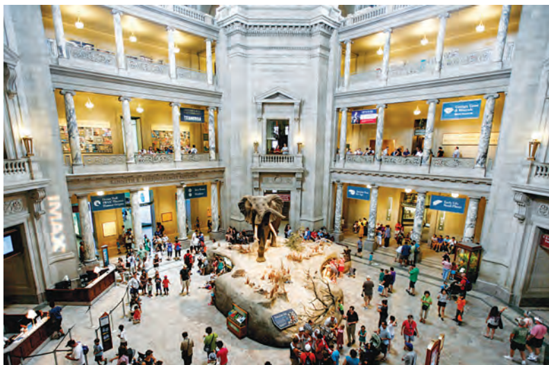
National Museum of Natural History

National Museum of natural History, United States of America : This museum of natural history managed by the Smithsonian Institution was established in 1846 C.E. It houses more than 12 crore (120 millions) specimens of fossils and remains of plants and animals, minerals, rocks, human fossils and artefacts.