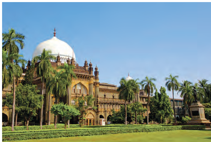
Chhatrapati Shivaji Maharaj Vastusangrahalay

The building of the museum is built in Indo-Gothic style. It has been given the status of Grade I Heritage Building in Mumbai. The museum houses about 50 thousand antiquities divided into three categories, Arts, Archaeology and Natural History.